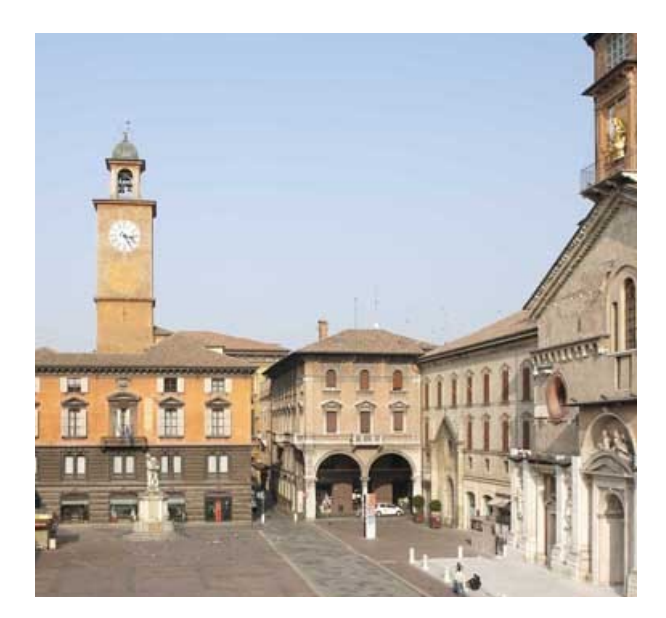
Reggio Emilia, Prampolini Square