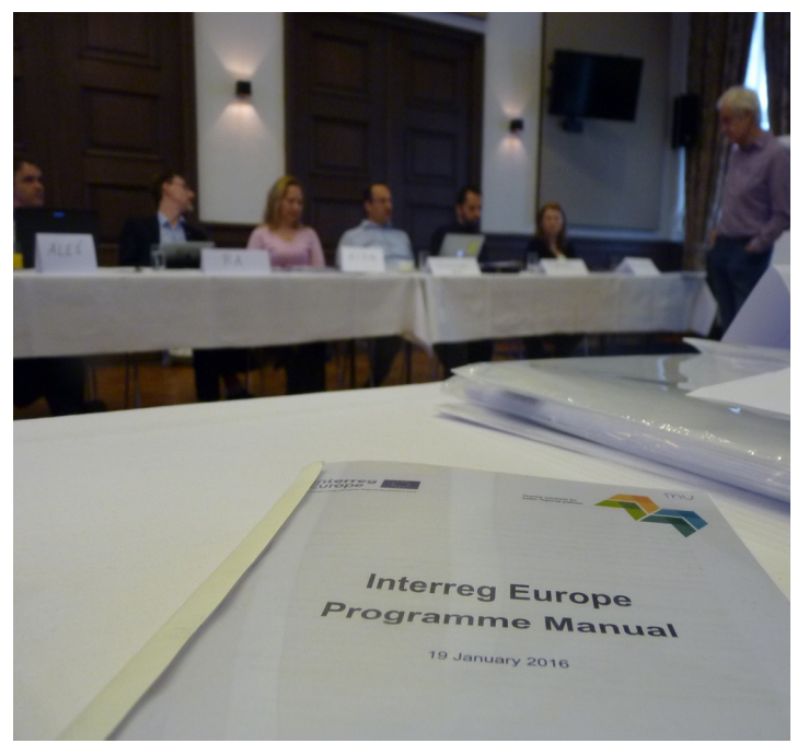
RESOLVE Kick Off meeting, Roermond, April 2016