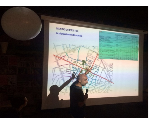
Reggio Emilia, meetings with retailers and residents