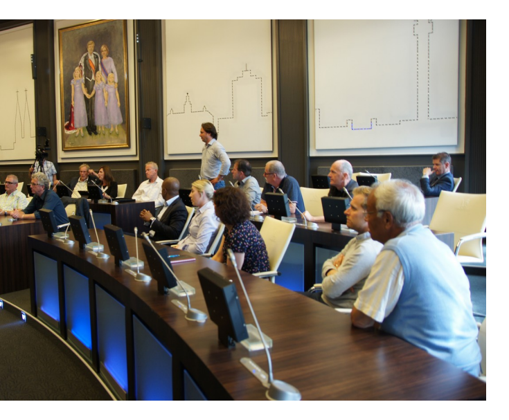
Roermond Peer Review, July 2016