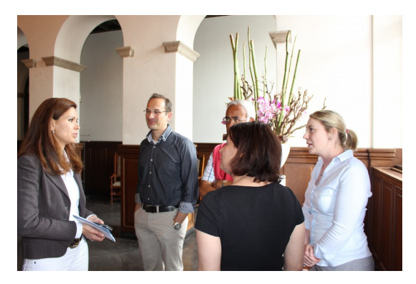
Roermond Peer Review, July 2016