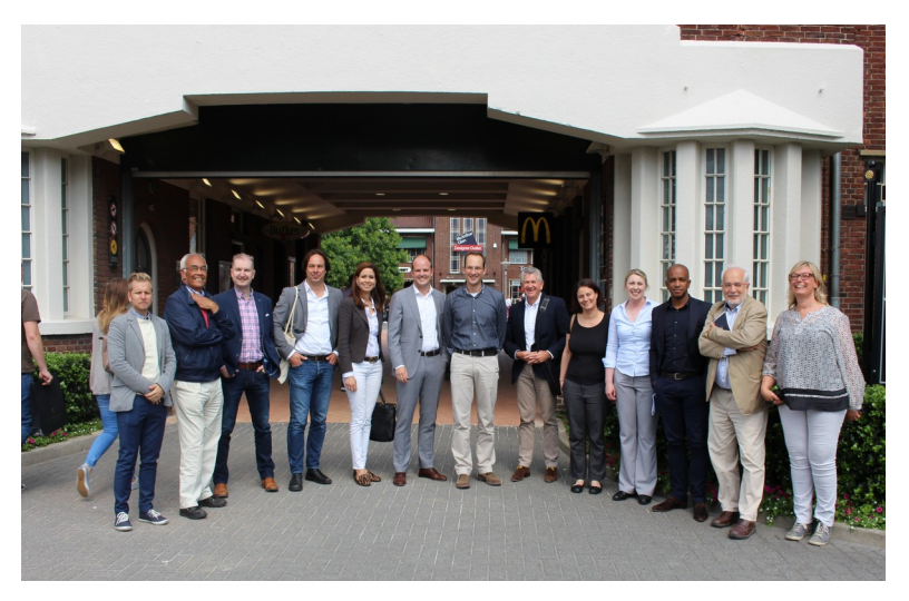
Experts from Portugal, Sweden, UK and the Netherlands at Roermond Peer Review

peer review each other's mobility plans, using the EC's SUMP Guidelines; identify good practices , for possible import; develop robust Regional Action Plans that will propose both new projects and improved governance devise , test and propose a Monitoring and Evaluation Tool for ex-ante and ex-post appraisal of policies and initiatives in the field of sustainable mobility and retailing.